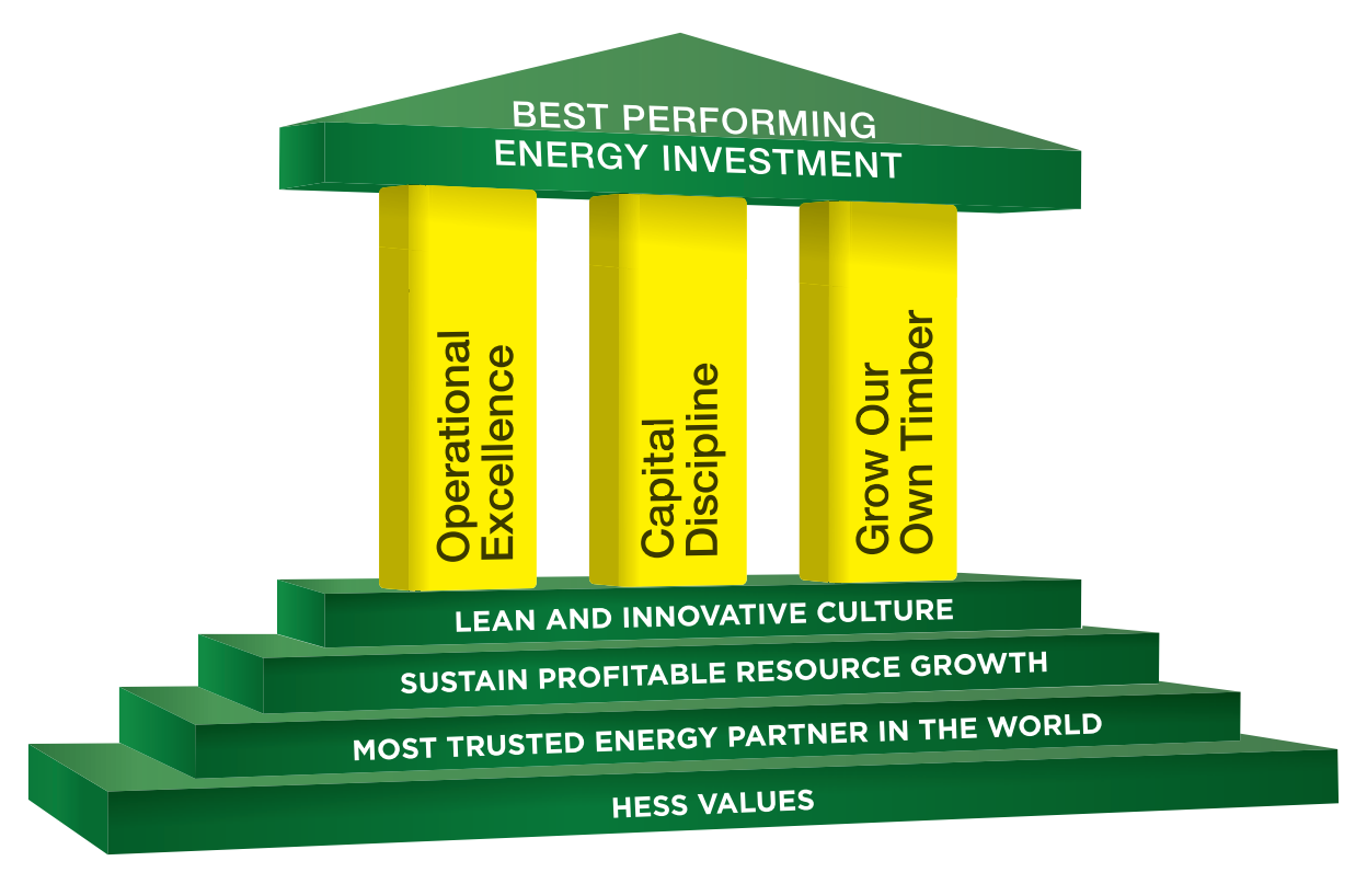
Figure 1: House of Hess

The purpose of this manual is to illustrate what the Hess Operational Management System (HOMS) is and how it supports the Operational Excellence pillar through a continuous improvement cycle. Figure 1 illustrates the House of Hess. The purpose of HOMS is to help Hess operate in a safe, responsible and efficient manner.