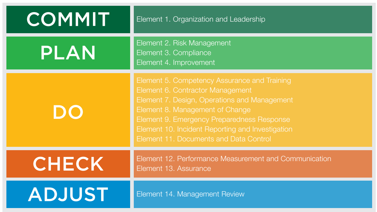
Figure 3: Elements in the Continuous Improvement Cycle

HOMS is based on a continuous improvement cycle. The HOMS framework is meant to enable business units to meet objectives in a safe and responsible manner while systematically searching for improvement opportunities and striving for excellence through establishment of a Commit-Plan-Do-Check-Adjust (standard terminology for Management Systems) cycle shown in Figure 3.