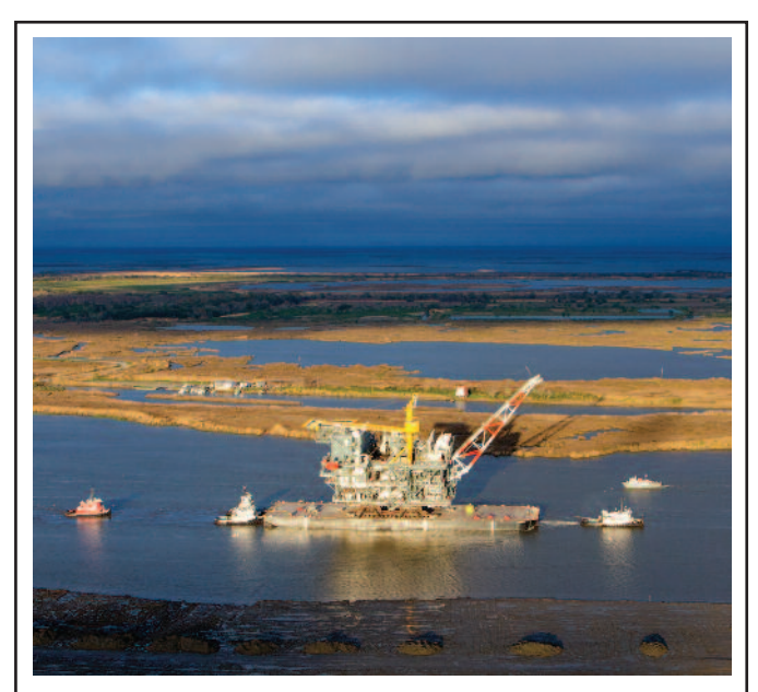
The 7,500-ton, three-level topsides departed Houma, La., in March 2014 in route to the Tubular Bells Field. The FPS was the first classic spar facility to be built entirely in the United States, with the topsides and hull fabrication work creating thousands of jobs in multiple states.

piles and structures), Weatherford (subsea control system), Oceaneering (umbilical system), FMC (subsea tree and equipment), Subsea 7 (installation of umbilicals, flying leads, production manifold and jumpers), and ClampOn (subsea acoustic sand and pig detection). Tenaris provided almost nine miles of eightinch line pipe and the riser pipe.