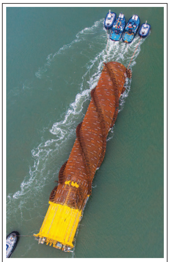
The 584-foot long hull is shown here in February 2014 as it was making its way through Aransas Pass along a 515-nautical-mile journey from Gulf Marine Fabricators' facility in Ingleside, Tx., to Mississippi Canyon 724. Once on location, the hull was upended, ballasted and moored in position.